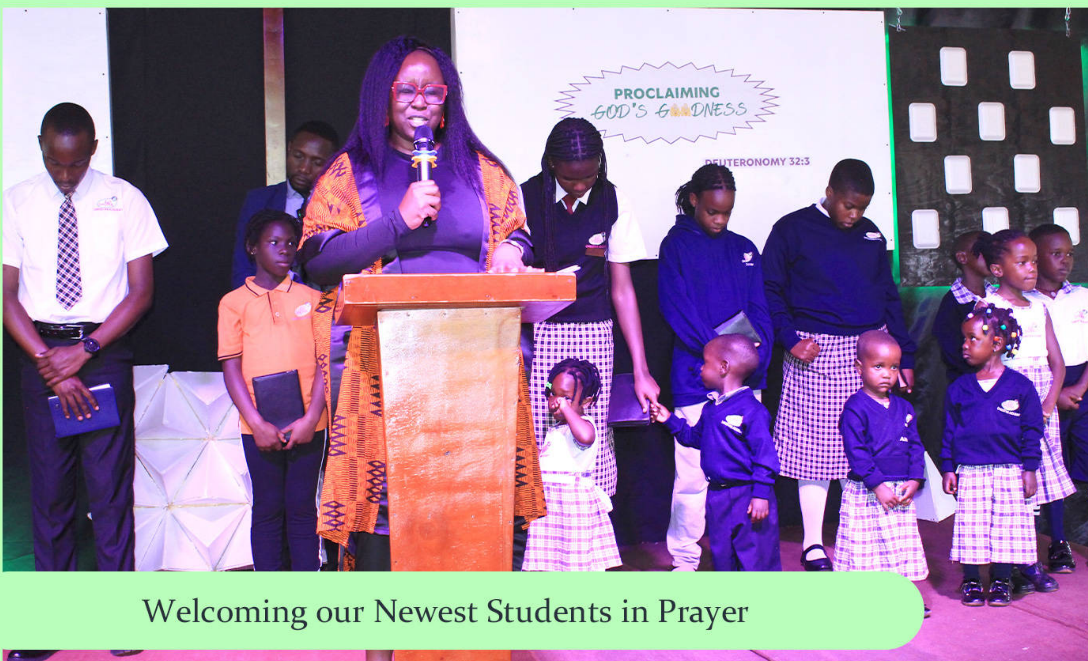
Welcoming our Newest Students in Prayer