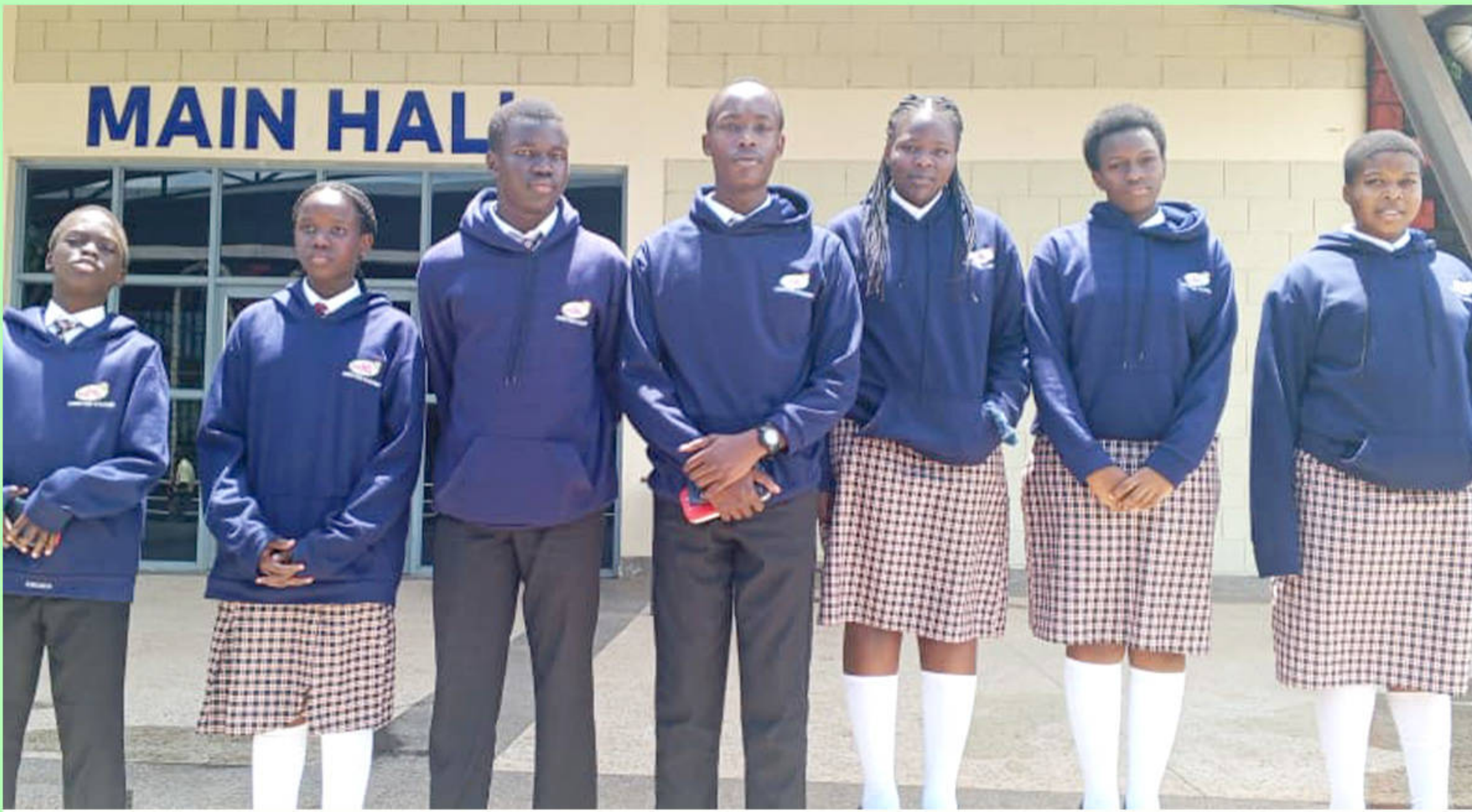
Shoma Representatives in the National Math Contest