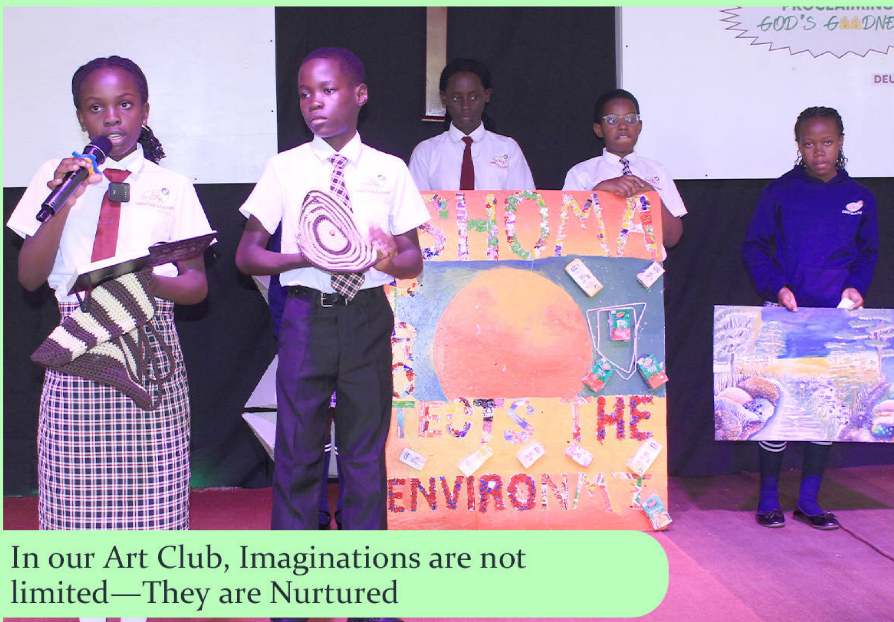
In our Art Club, Imaginations are not limited—They are Nurtured