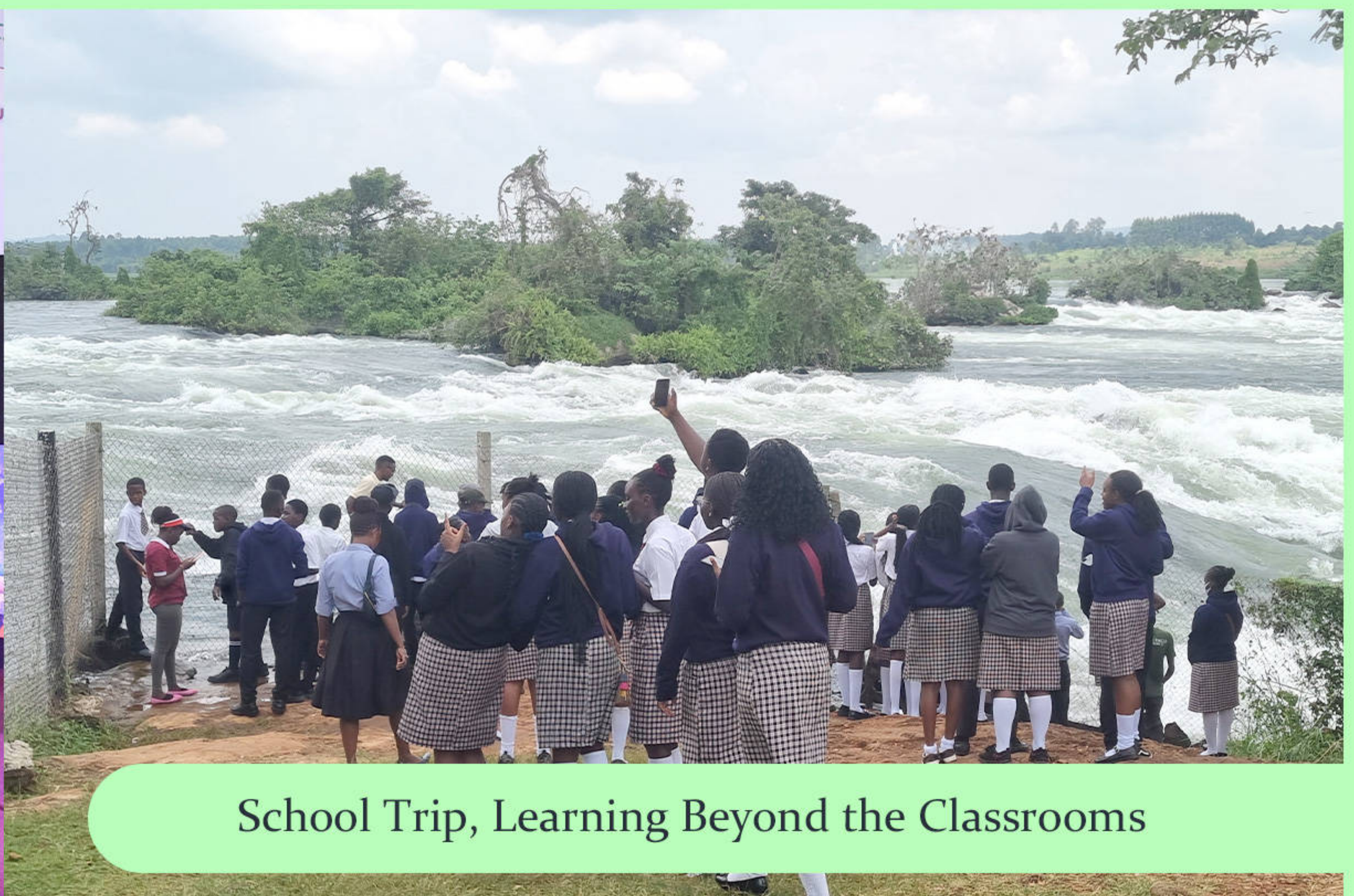
School Trip, Learning Beyond the Classrooms