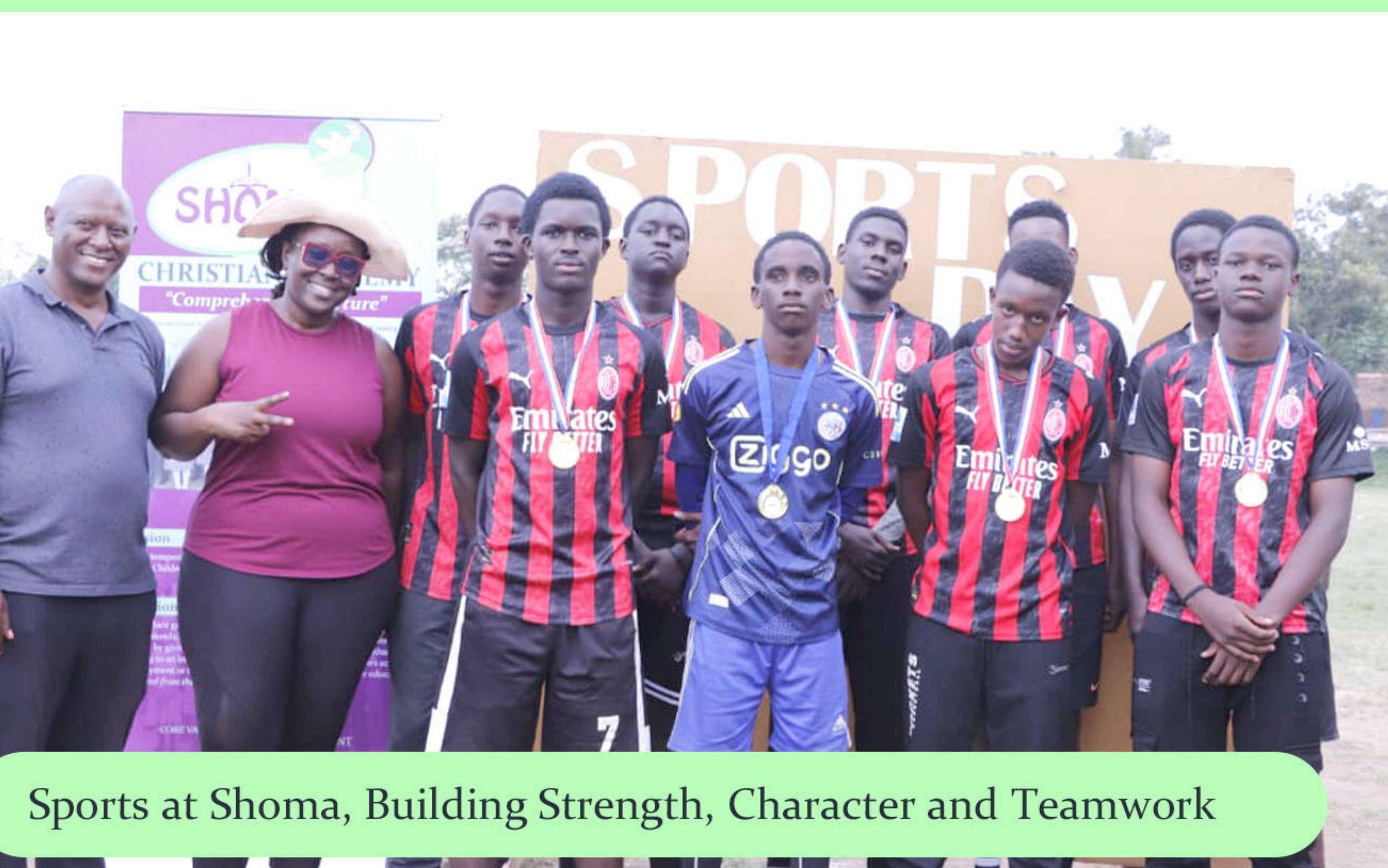
Sports at Shoma, Building Strength, Character and Teamwork