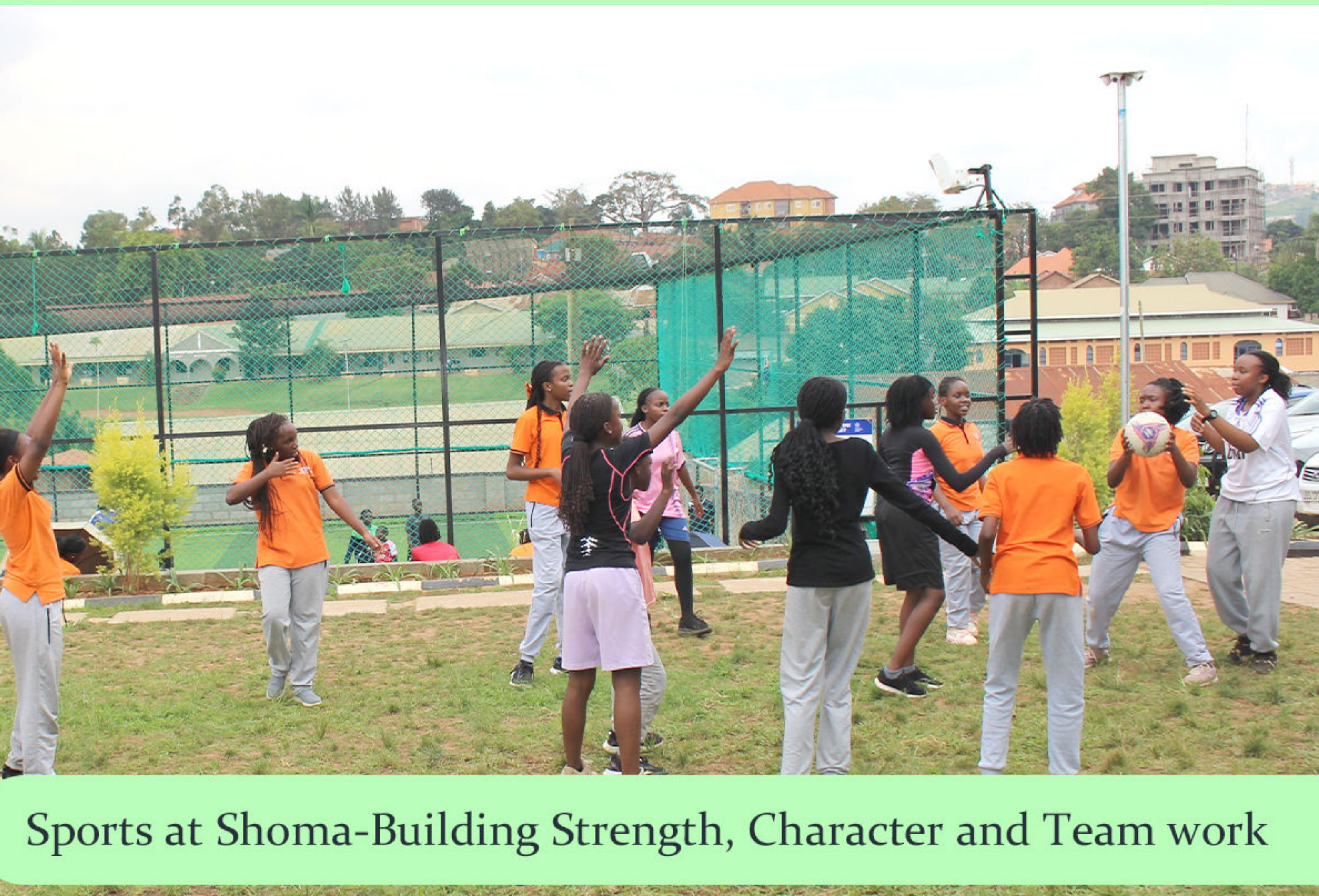
Sports at Shoma-Building Strength, Character and Team work