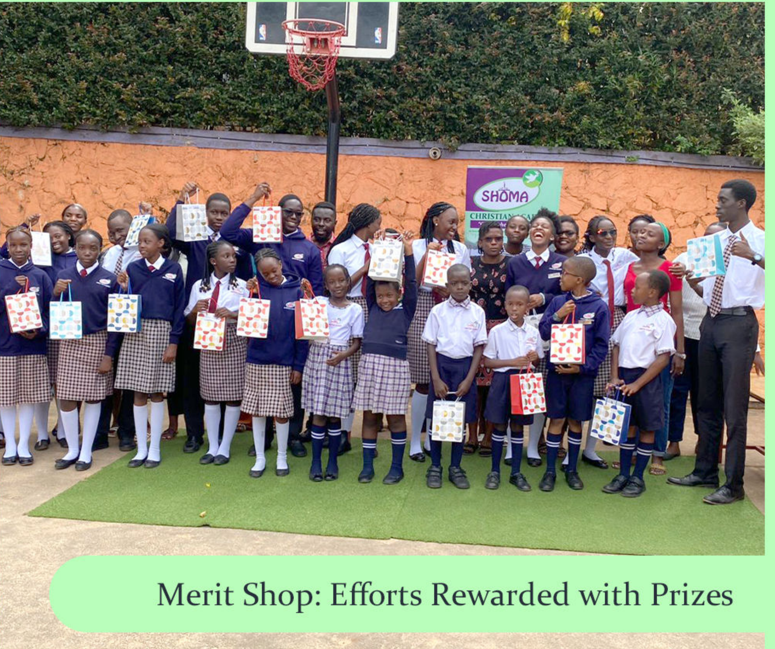
Merit Shop: Efforts Rewarded with Prizes