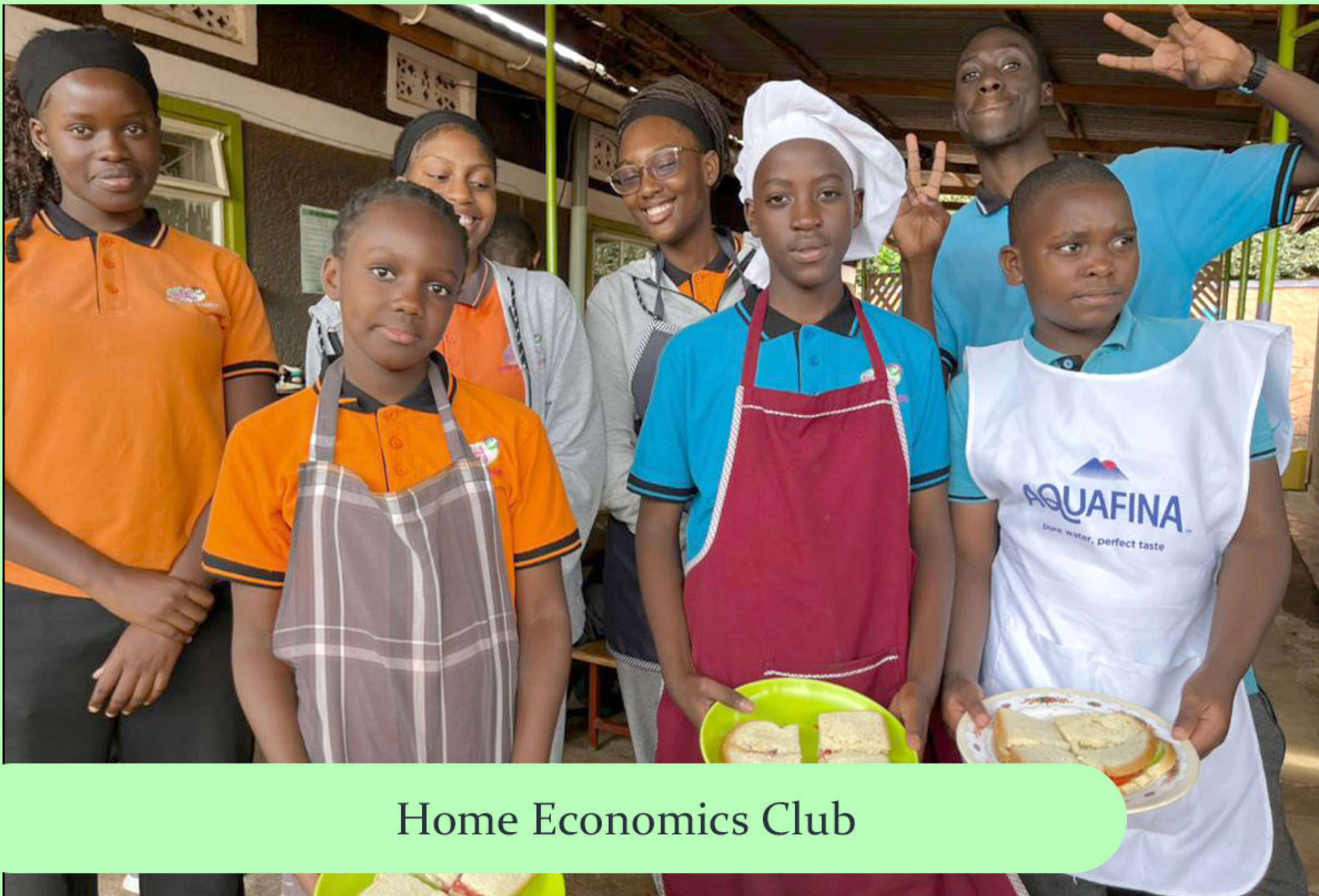
Home Economics Club