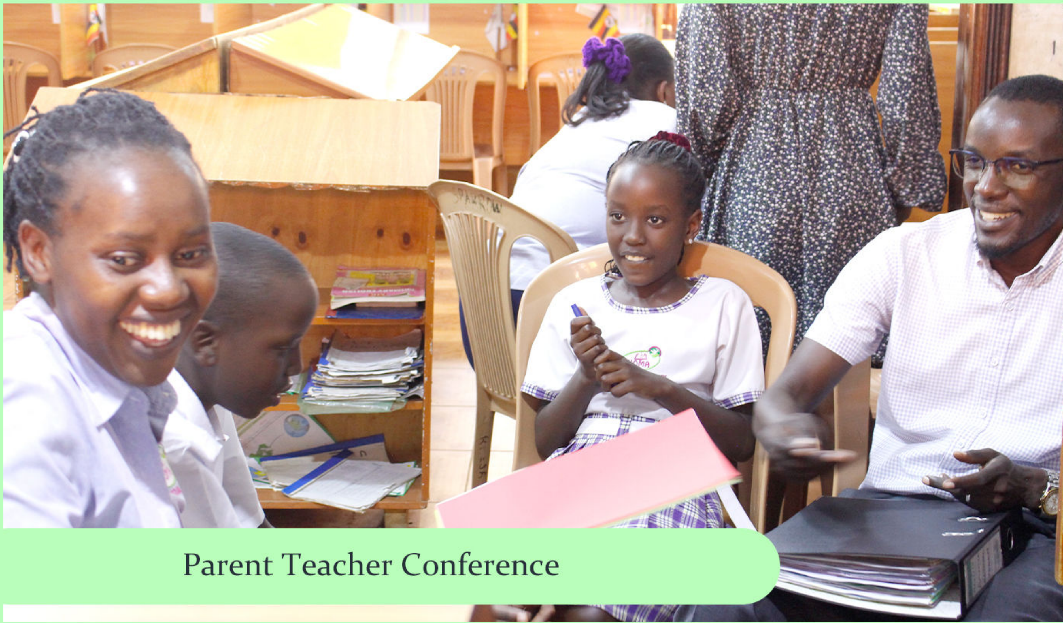
Parent Teacher Conference