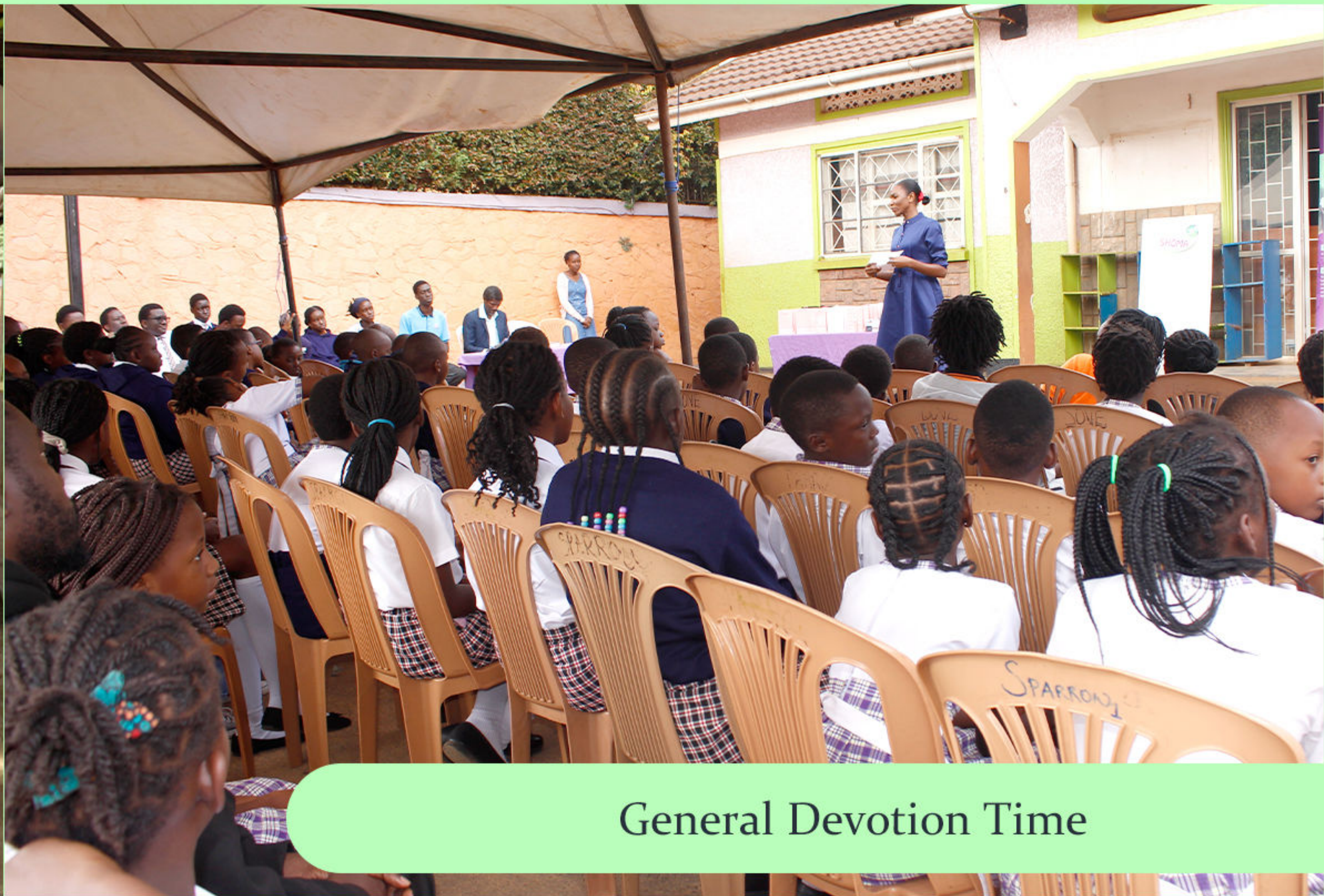
General Devotion Time