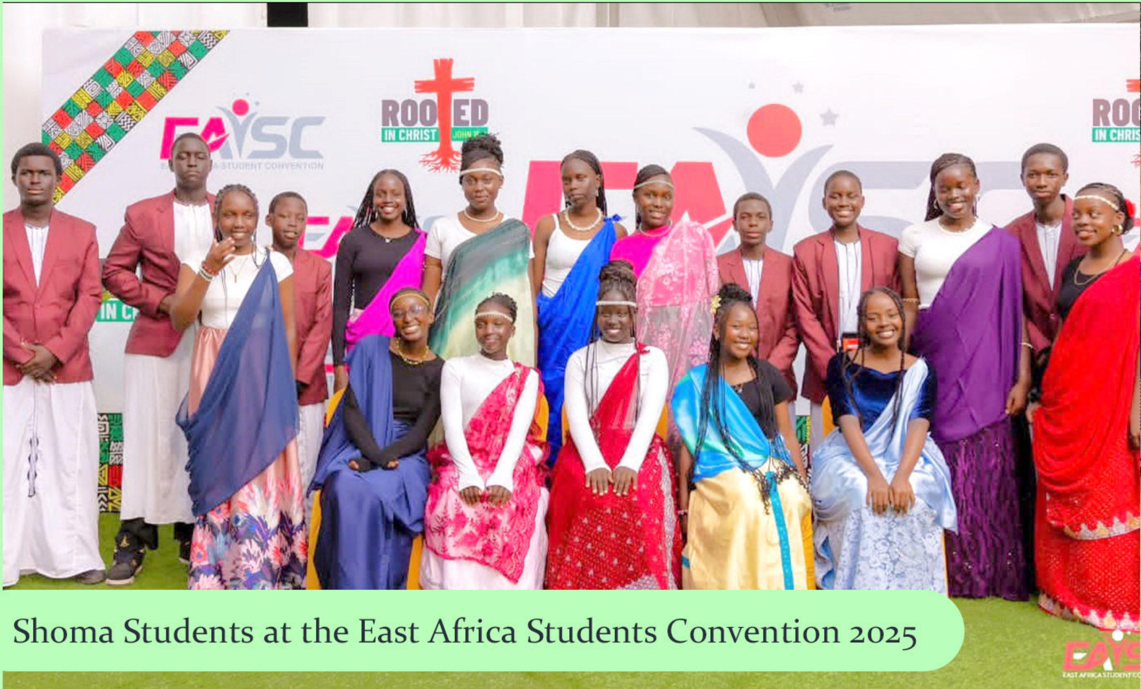
Shoma Students at the East Africa Students Convention 2025