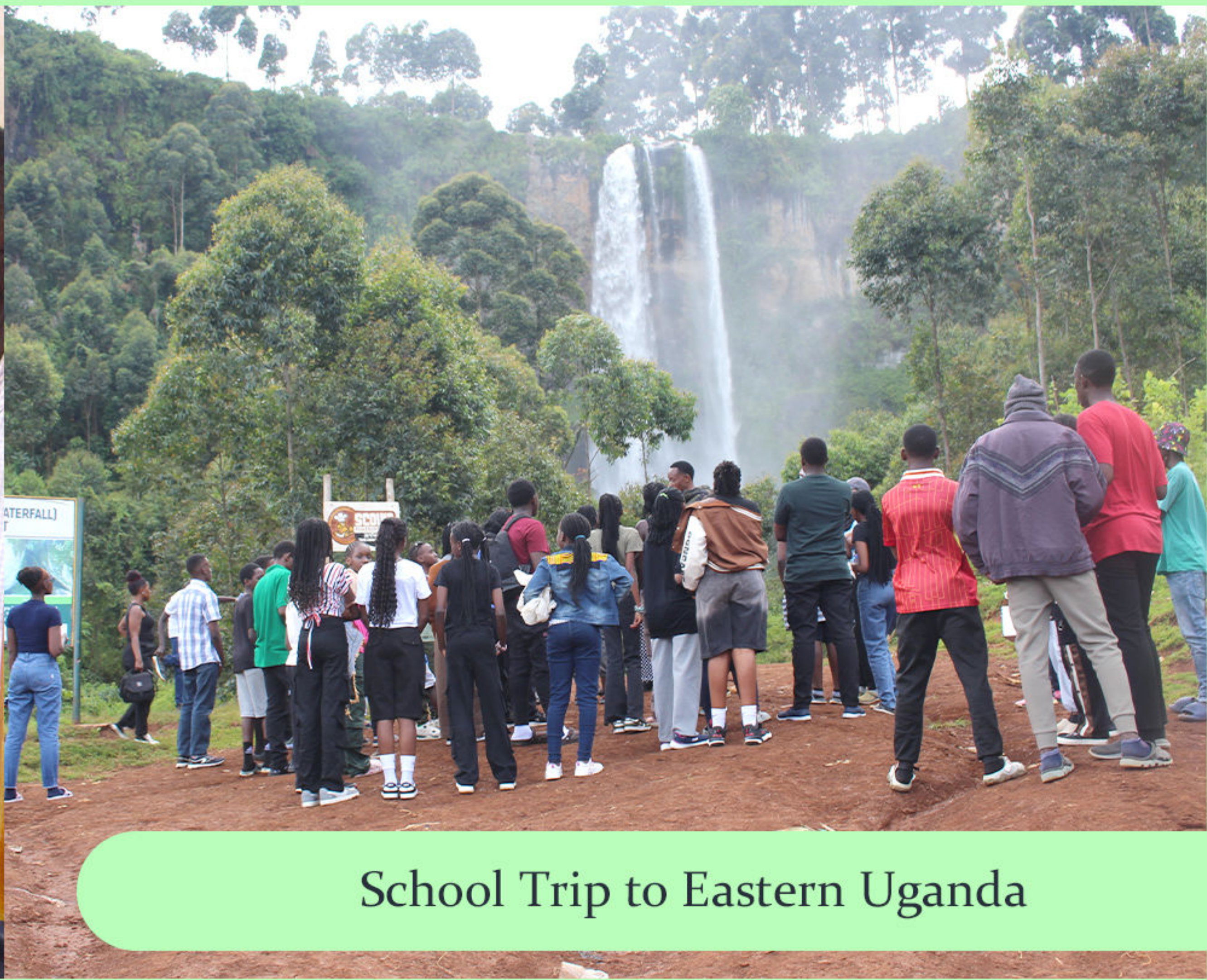
School Trip to Eastern Uganda