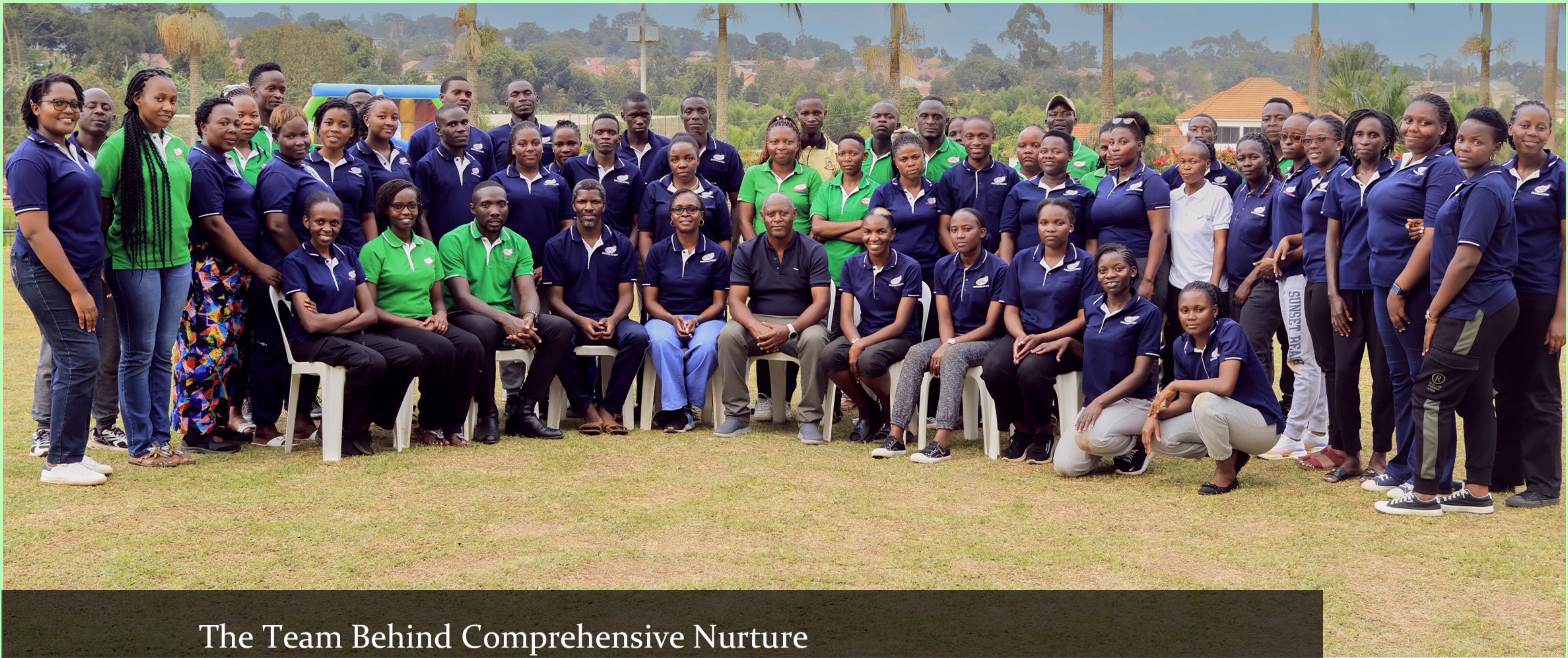
The Team Behind Comprehensive Nurture