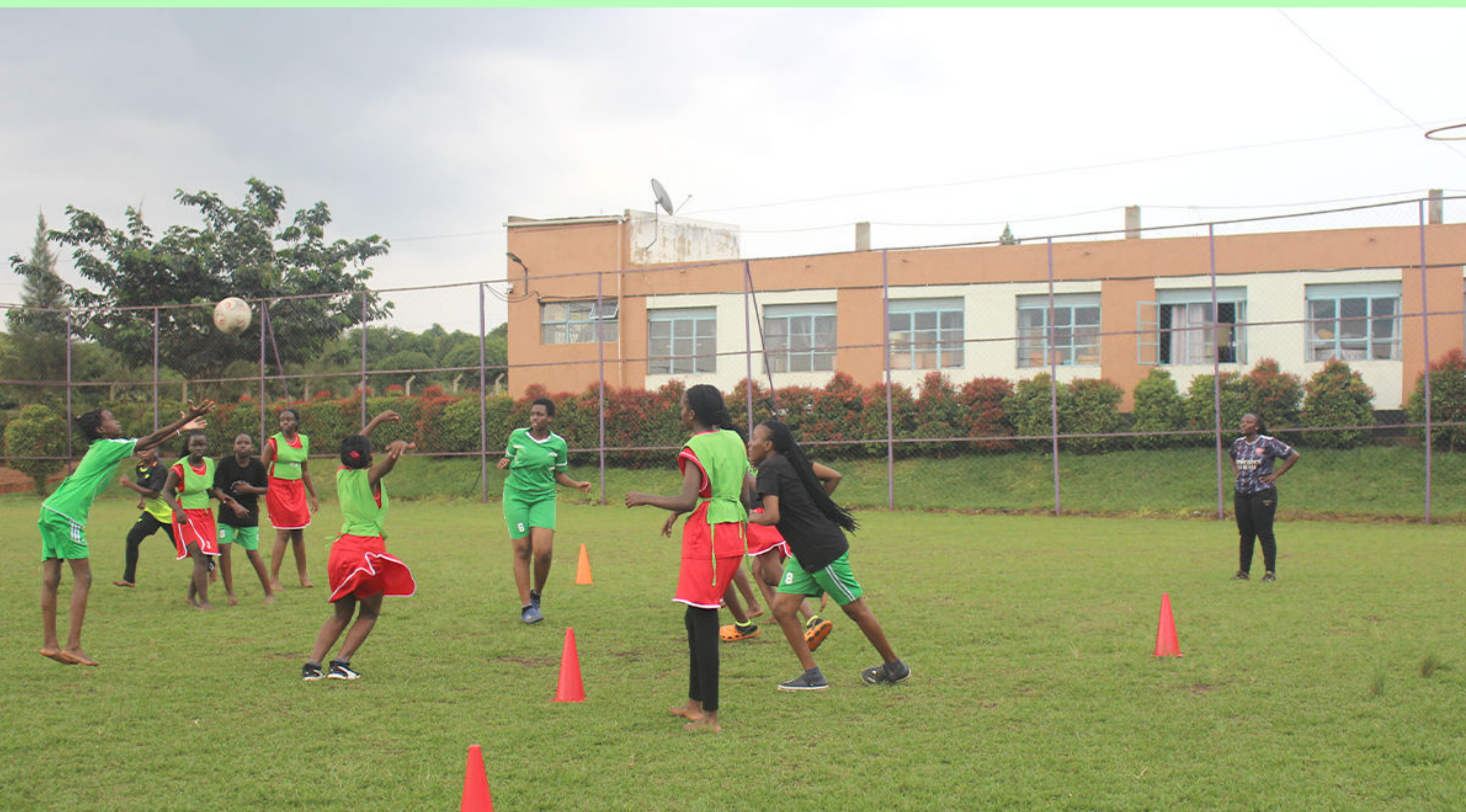
Sports at Shoma-Building Strength, Character and Team work