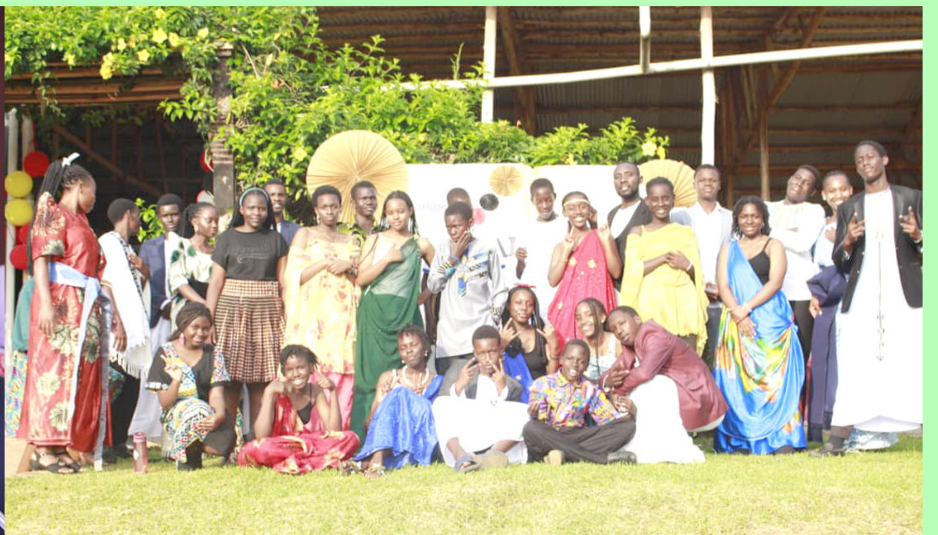
Cultural Day at Shoma - Celebrating Our Rich Heritage