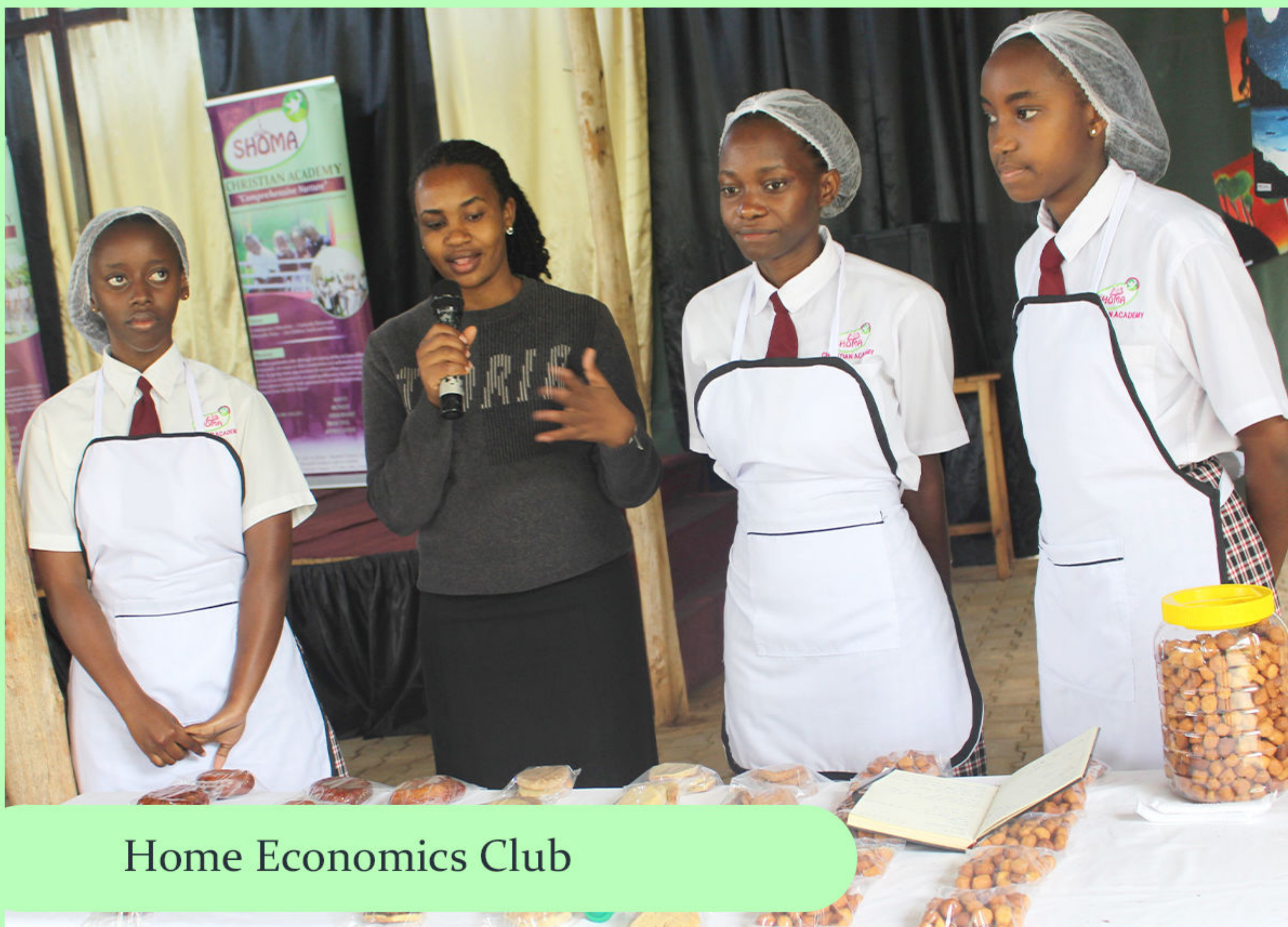
Home Economics Club