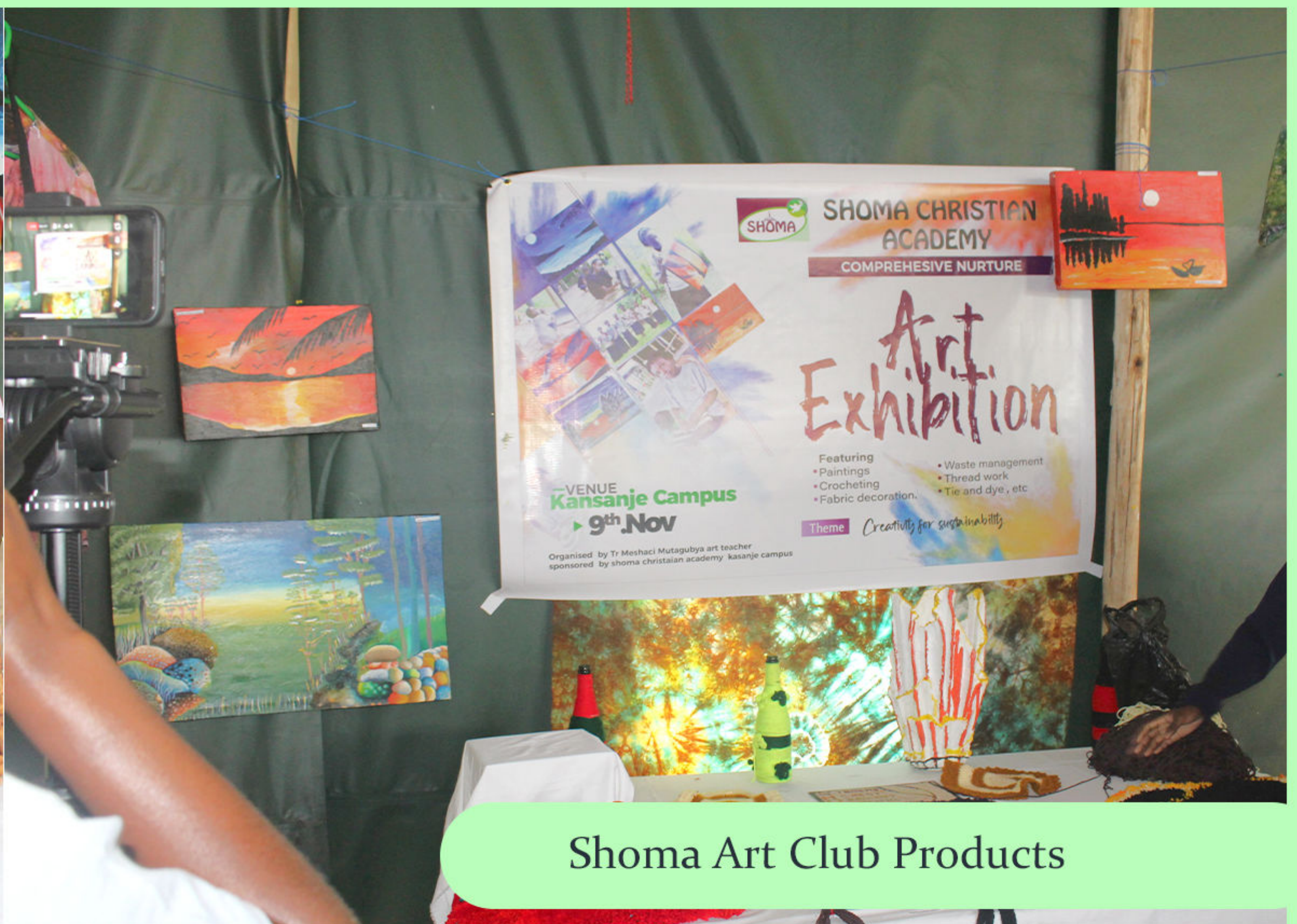
Shoma Art Club Products