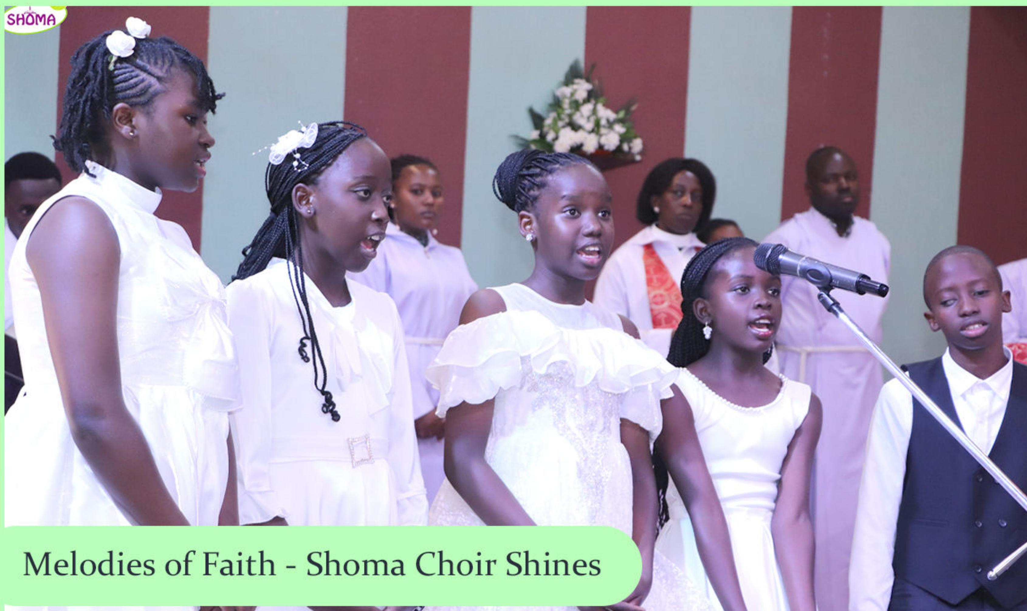
Melodies of Faith - Shoma Choir Shines