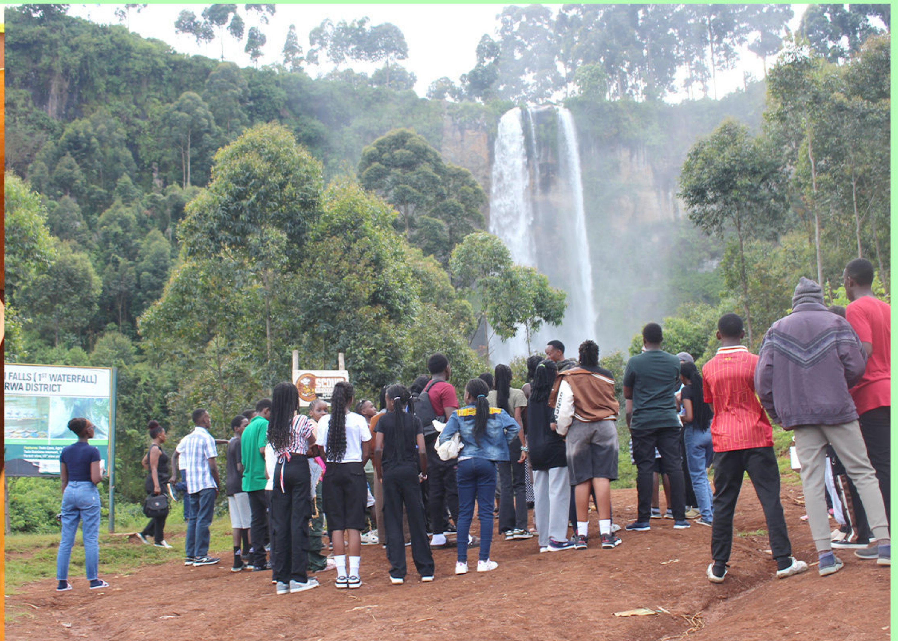
School Trip to Eastern Uganda