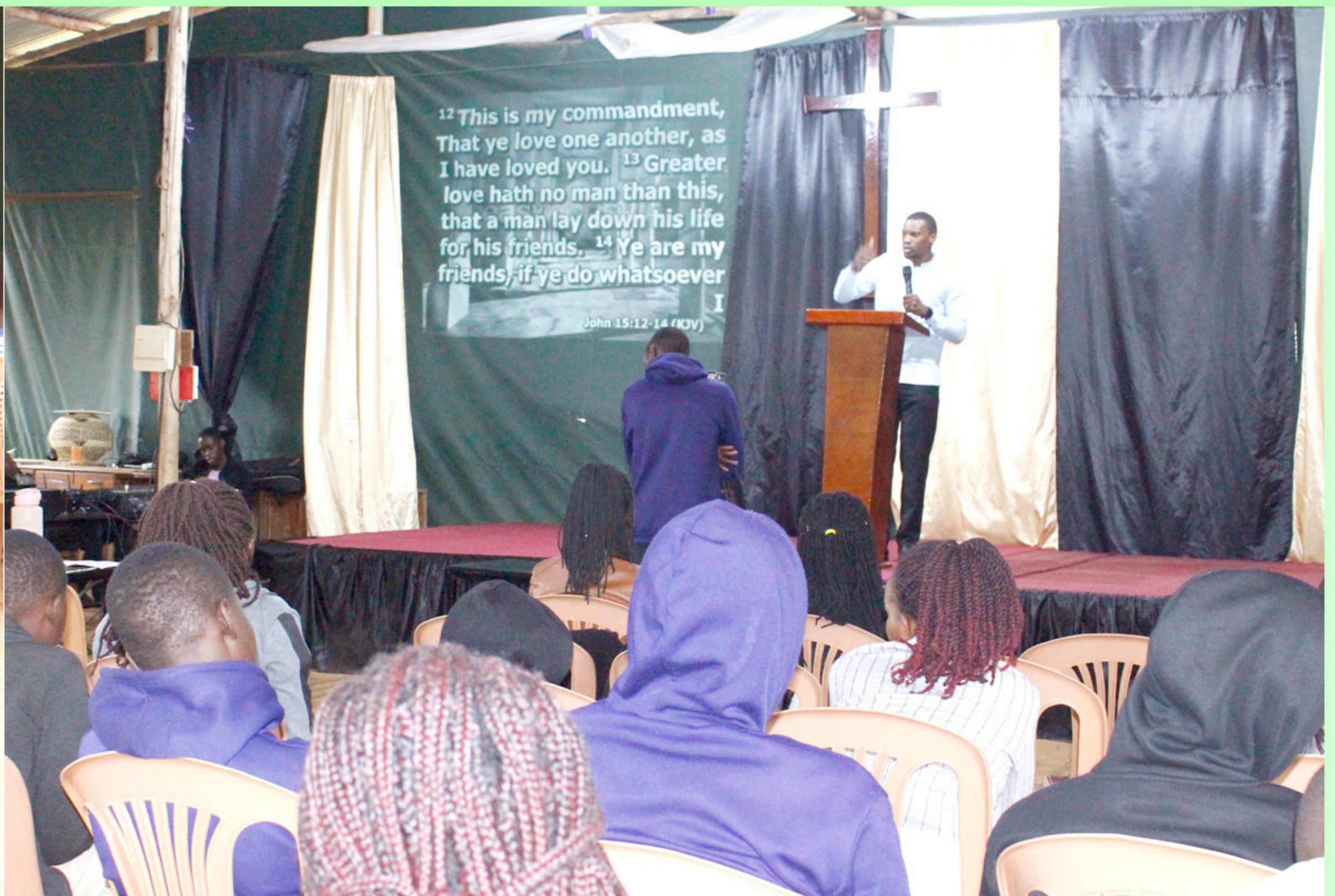
Mid Week Service