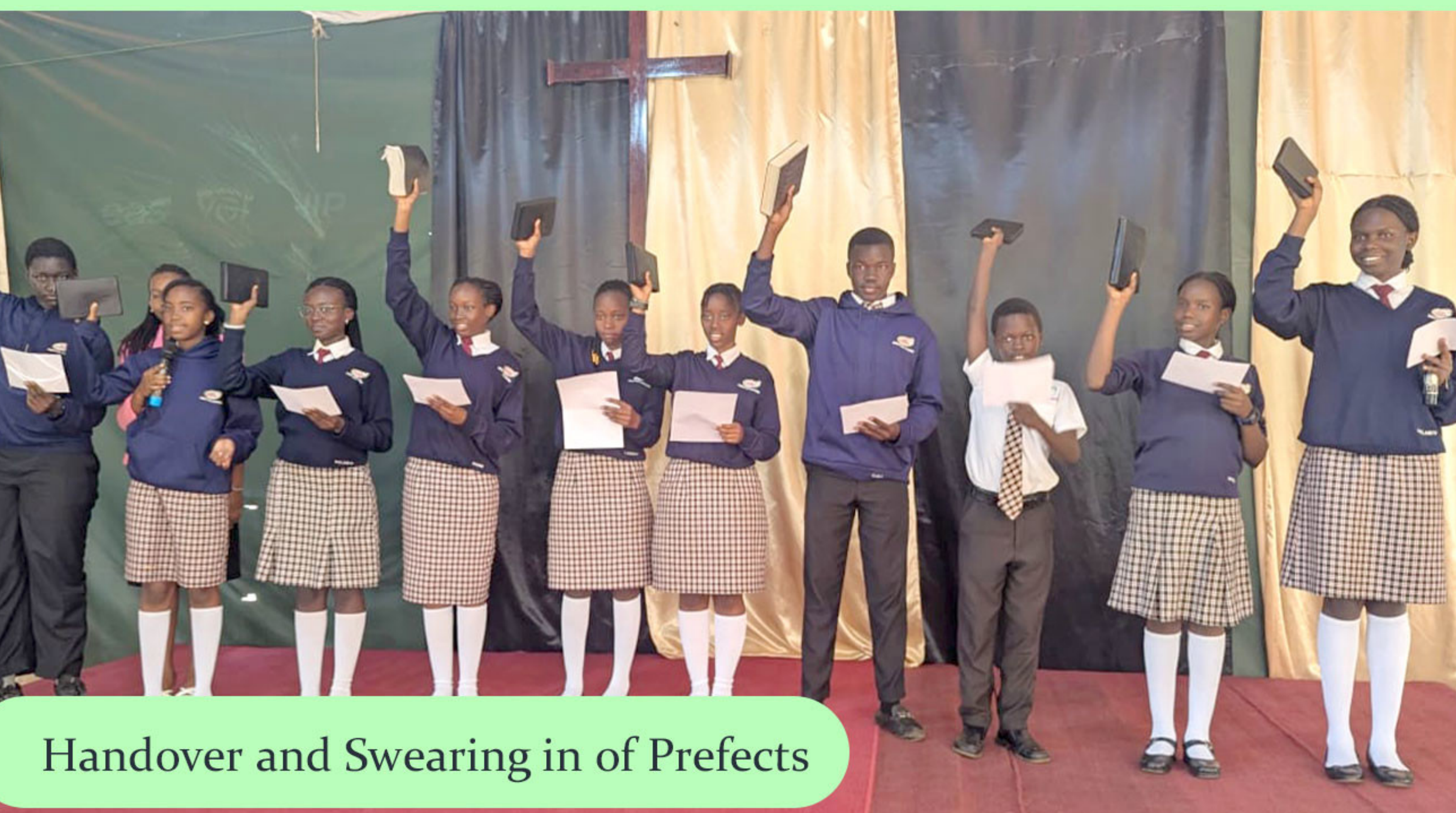
Handover and Swearing in of Prefects