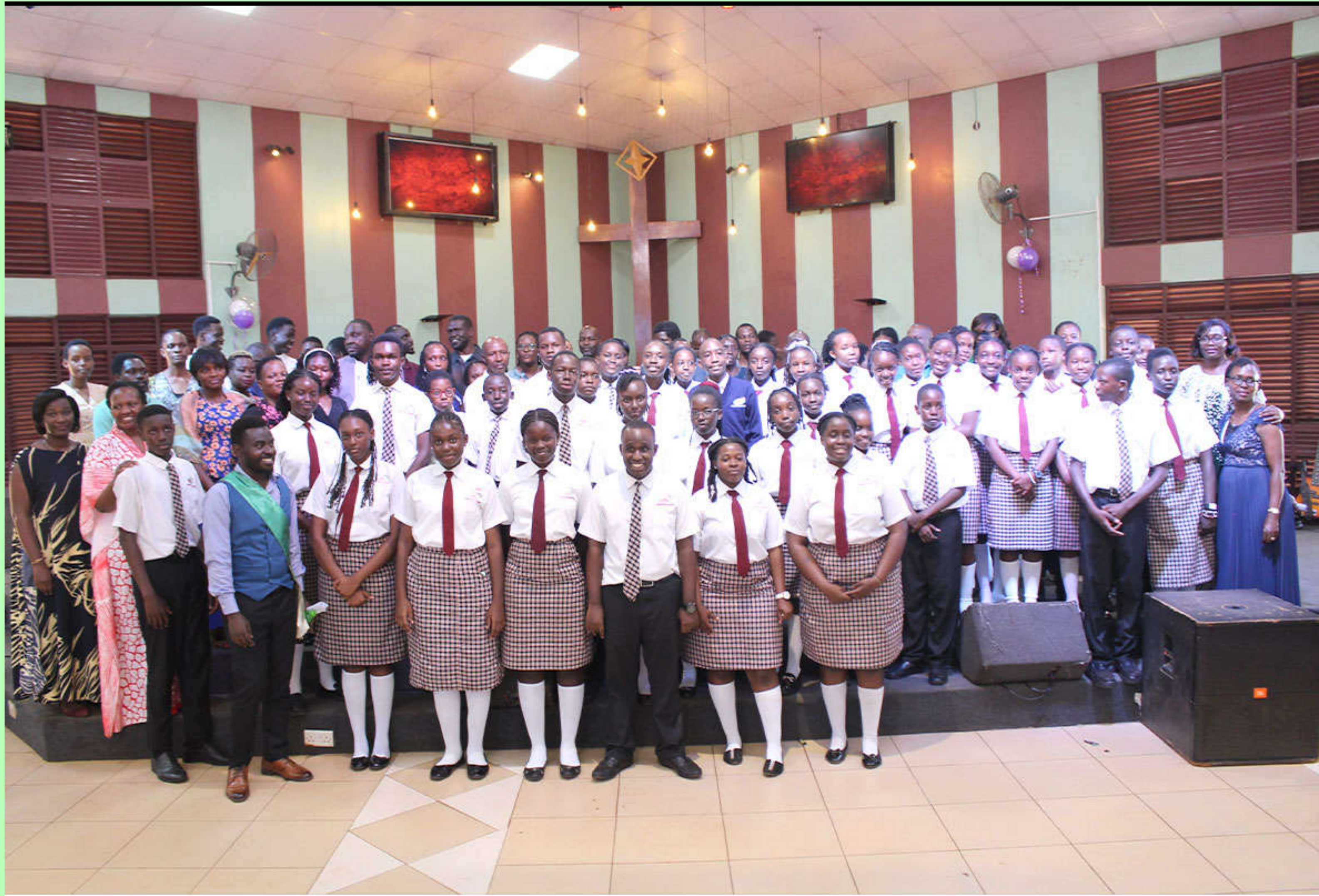
Thanksgiving - Ntinda Campus