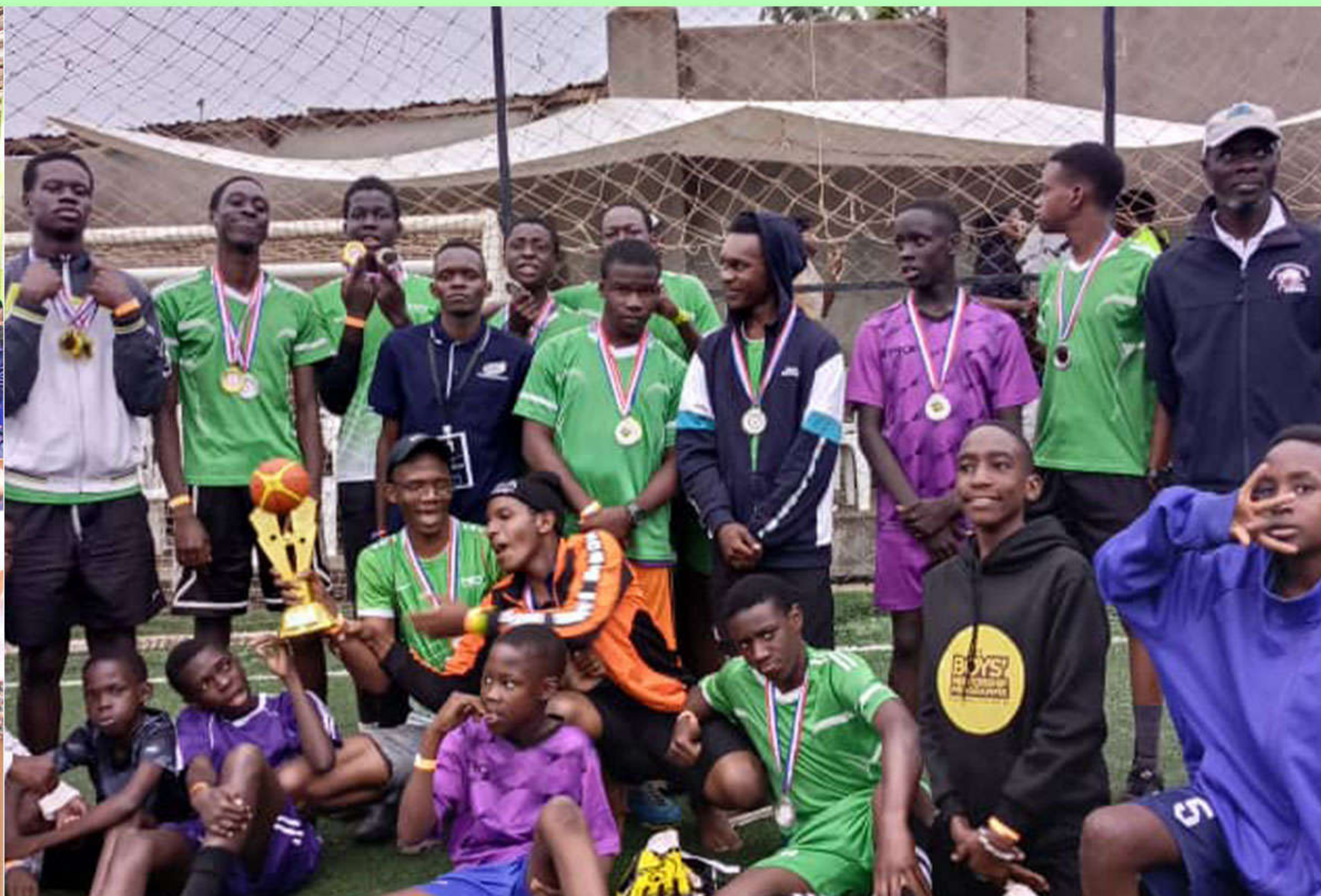
Shoma Students Shining at the FICA @10 Sports Gala