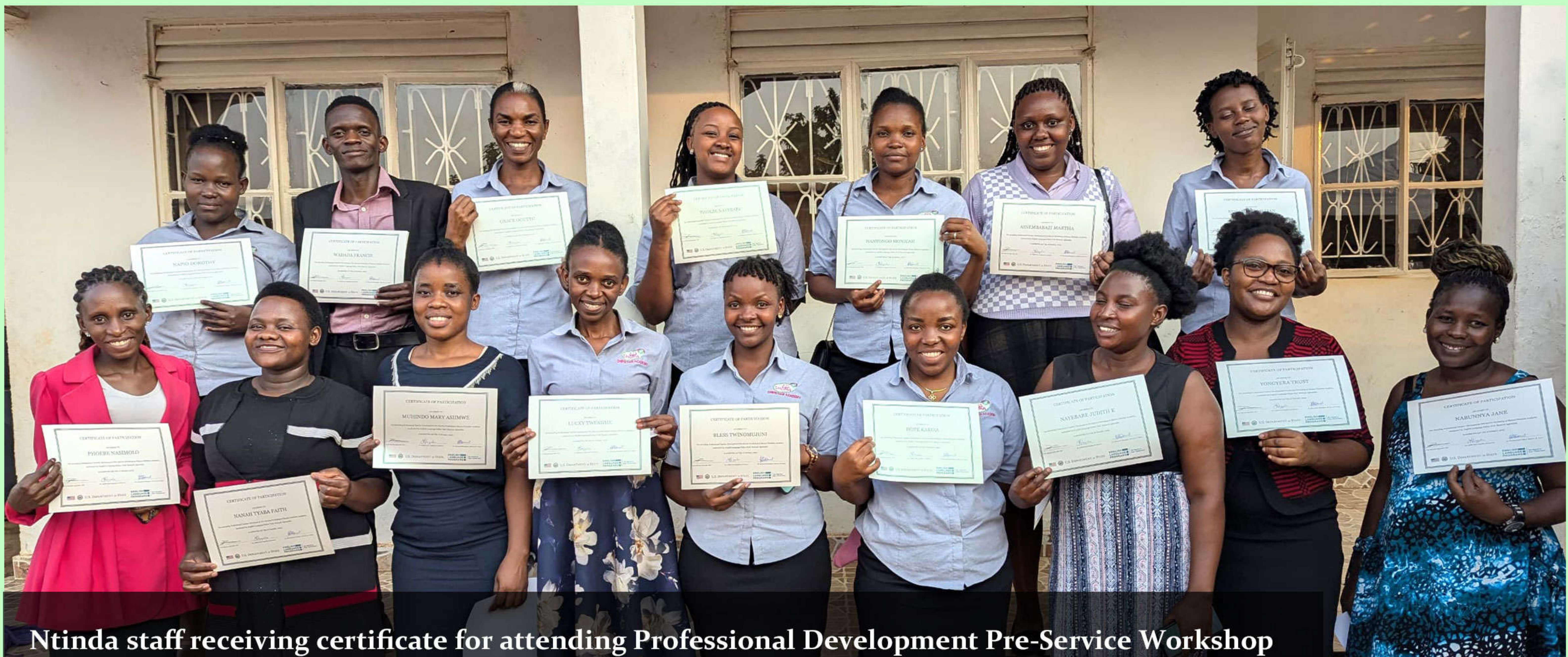
Ntinda staff receiving certificate for attending Professional Development Pre-Service Workshop