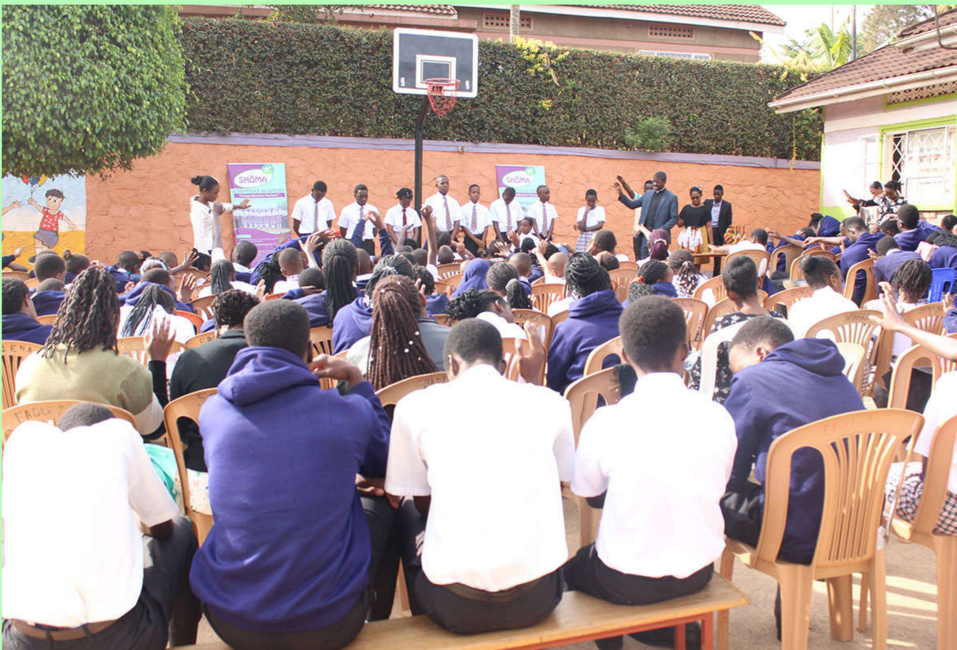
Admission Ceremony - Ntinda Campus