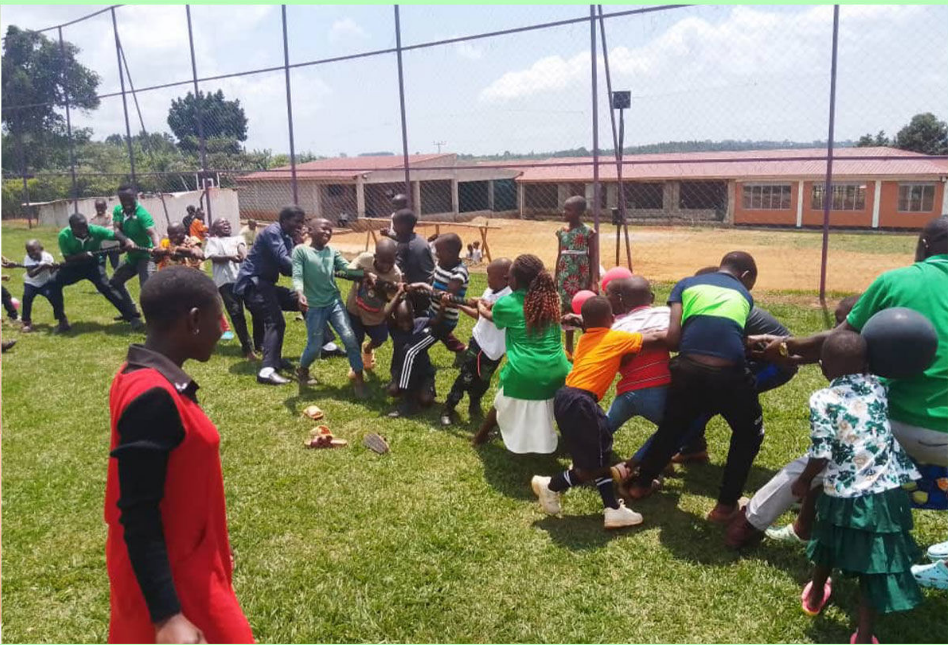
Sports with the community