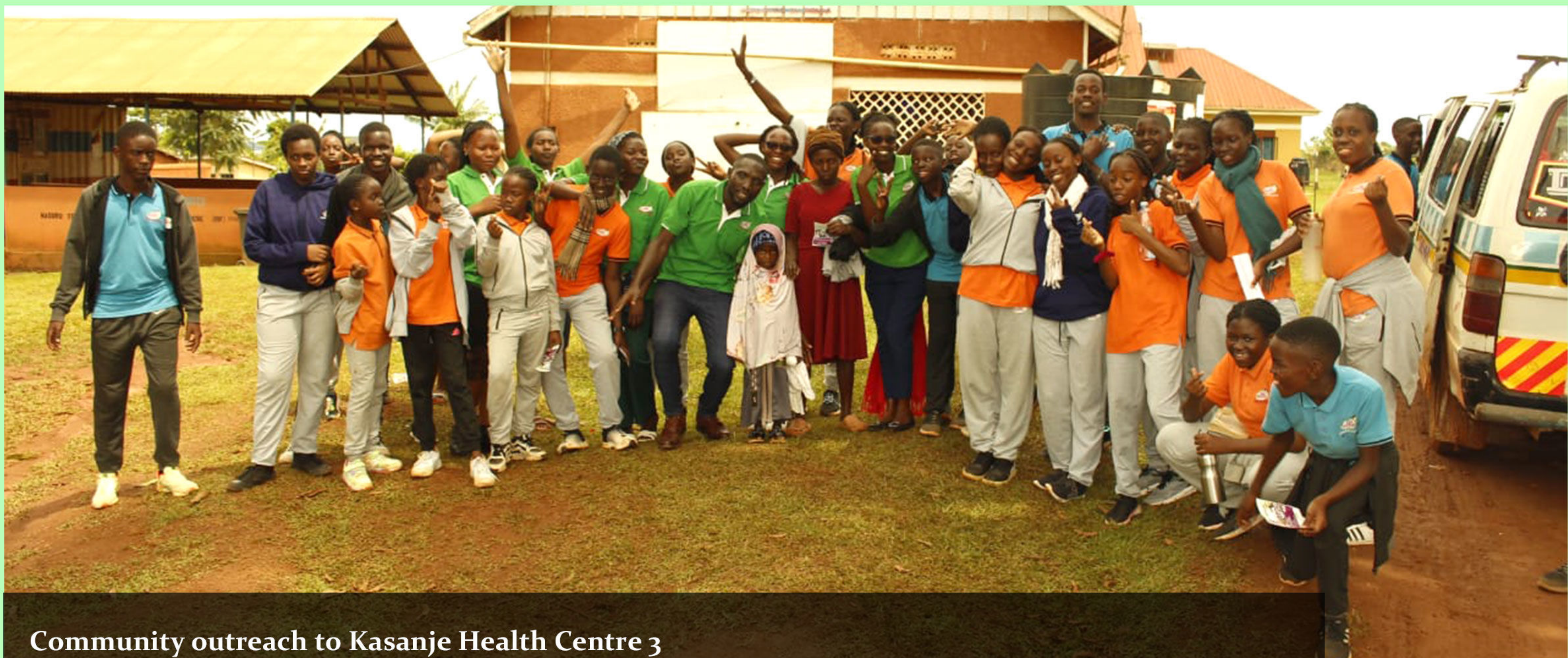
Community outreach to Kasanje Health Centre 3