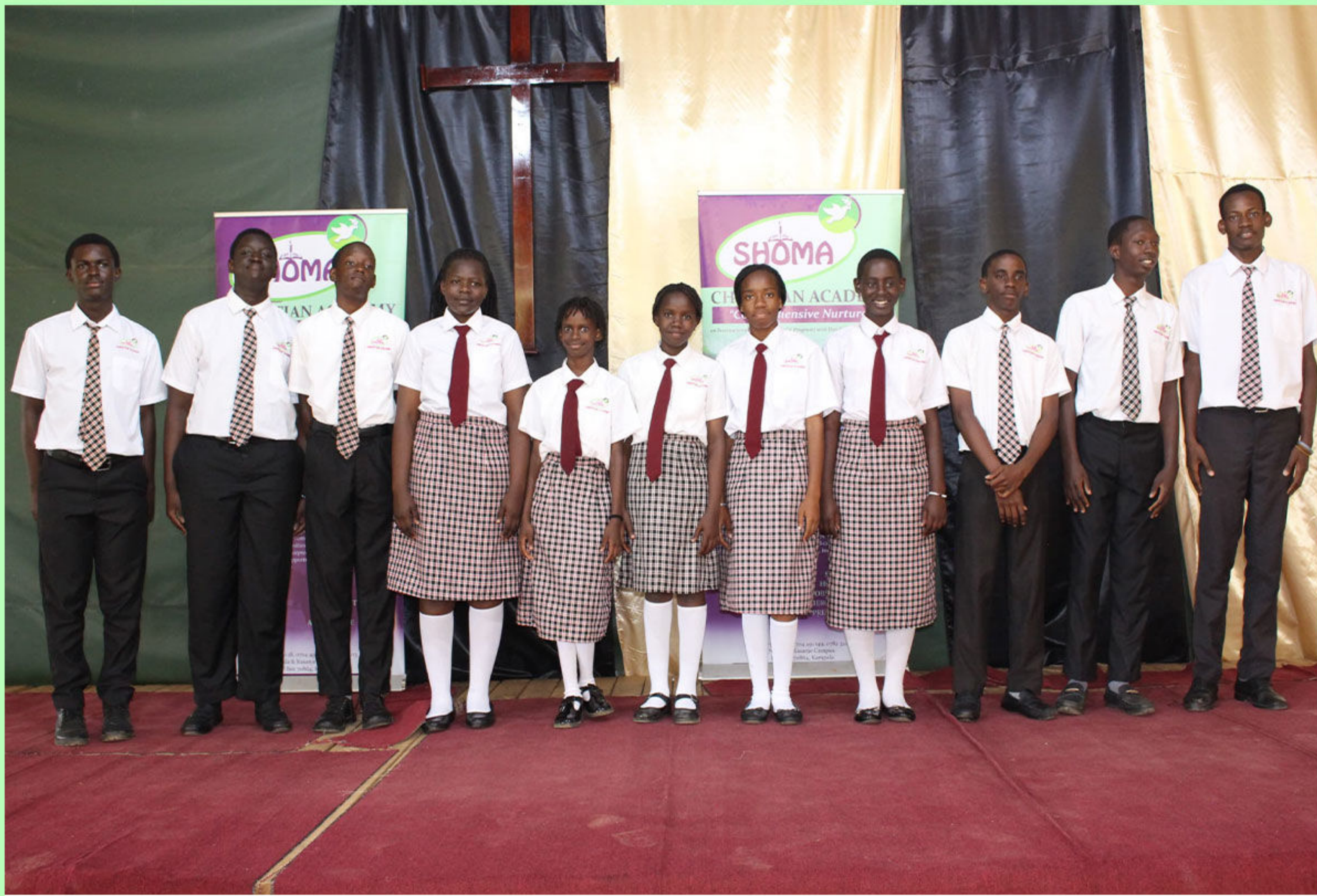
Thanksgiving - Kasanje Campus