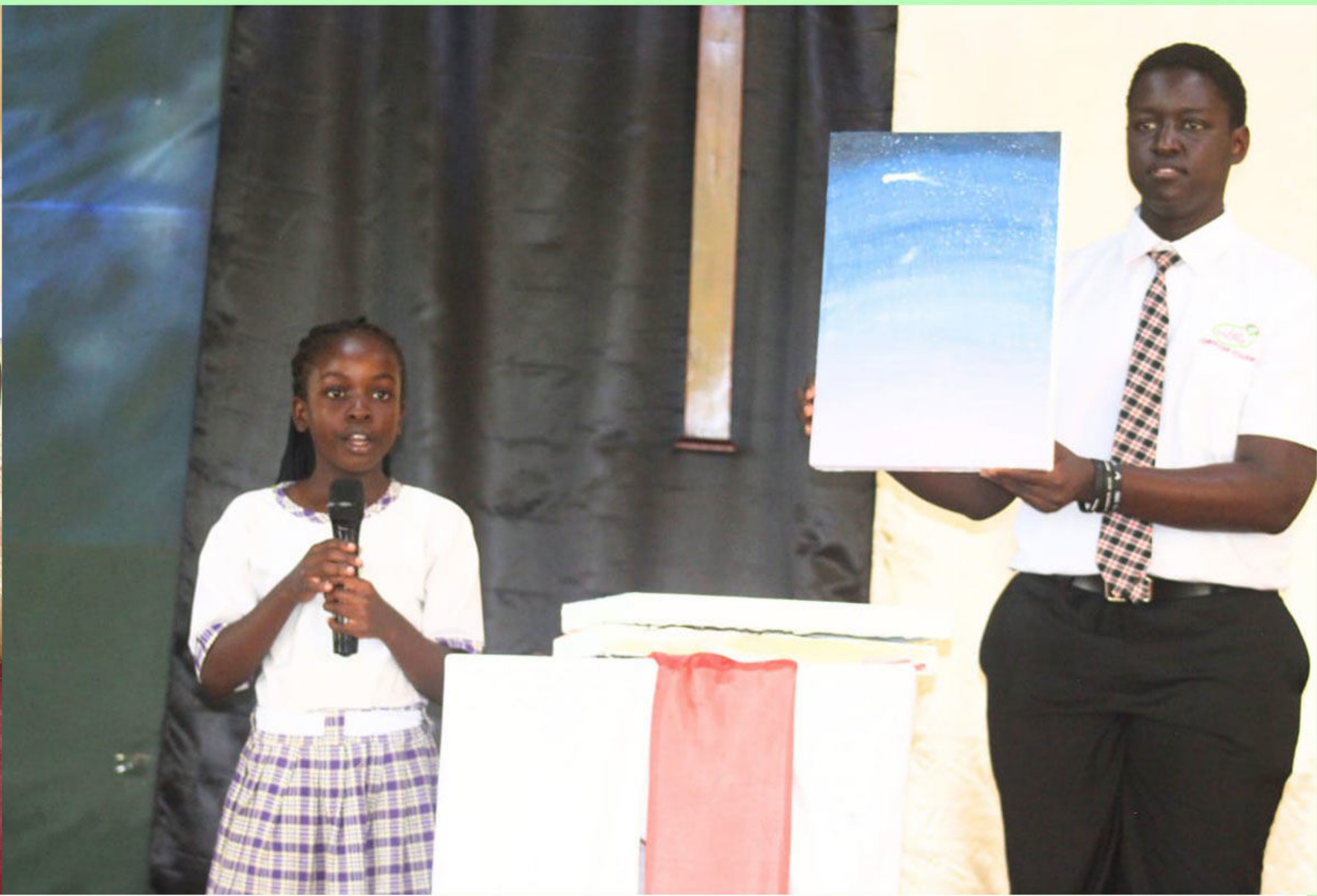
Art Piece Presentation