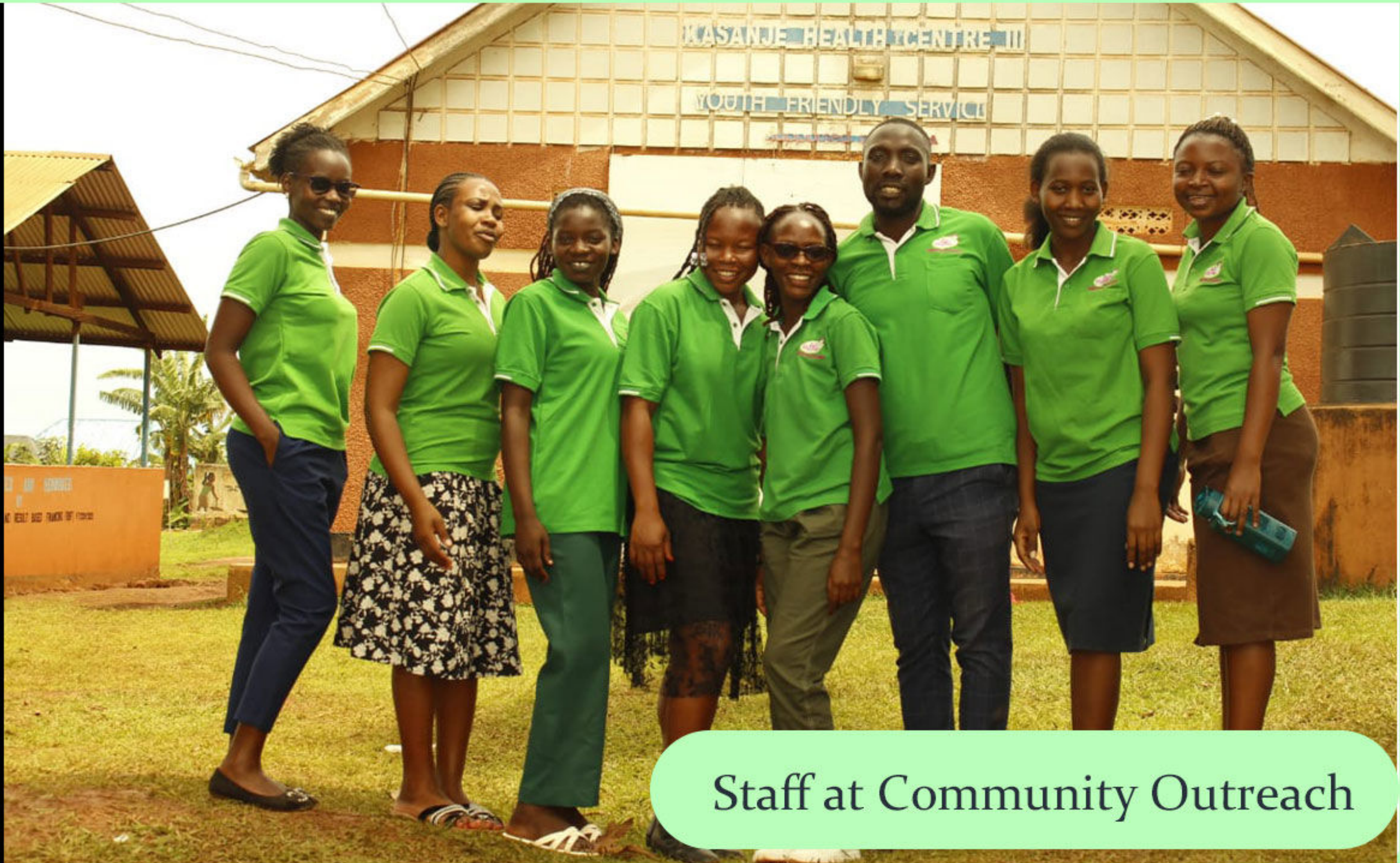
Staff at Community Outreach