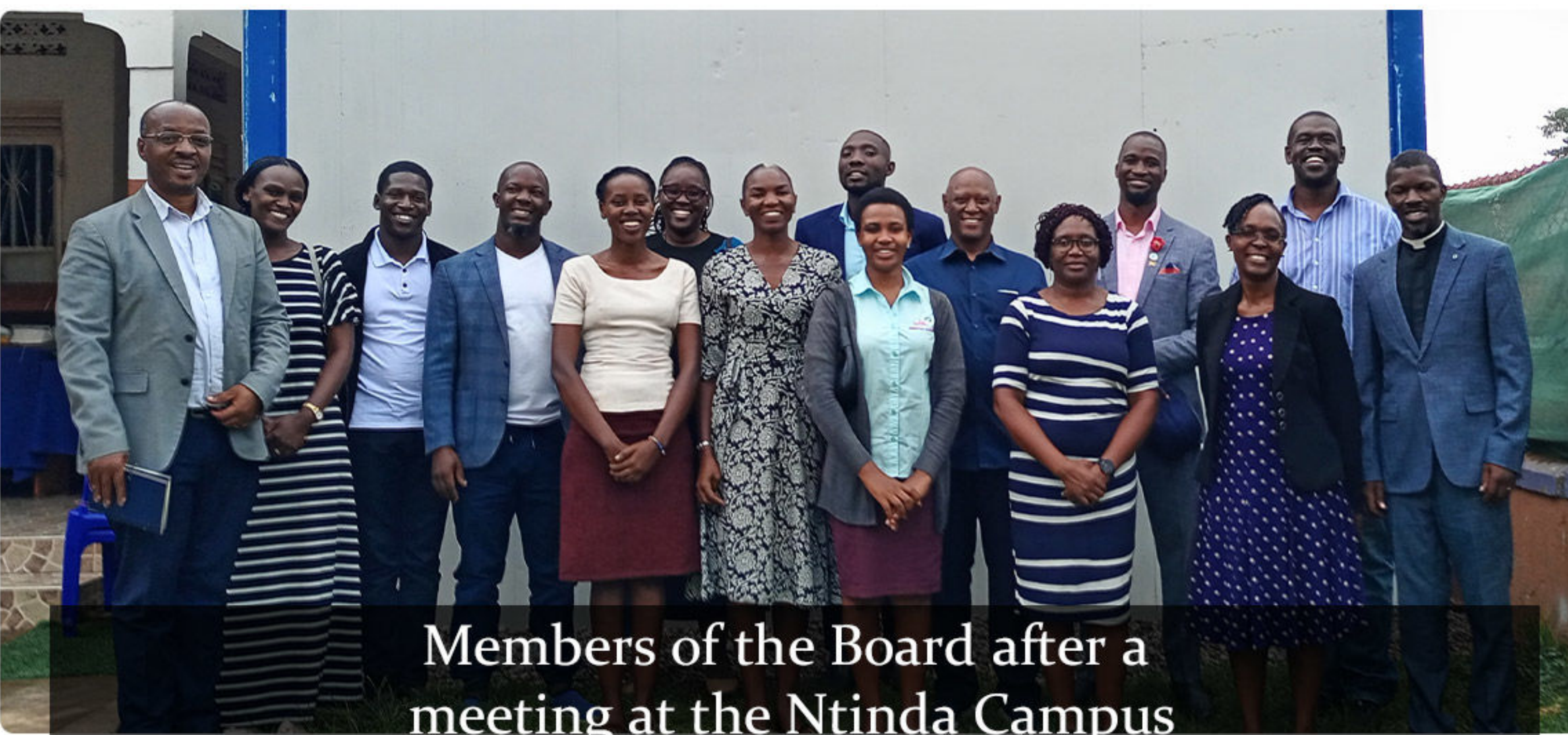
Members of the Board after a meeting at the Ntinda Campus