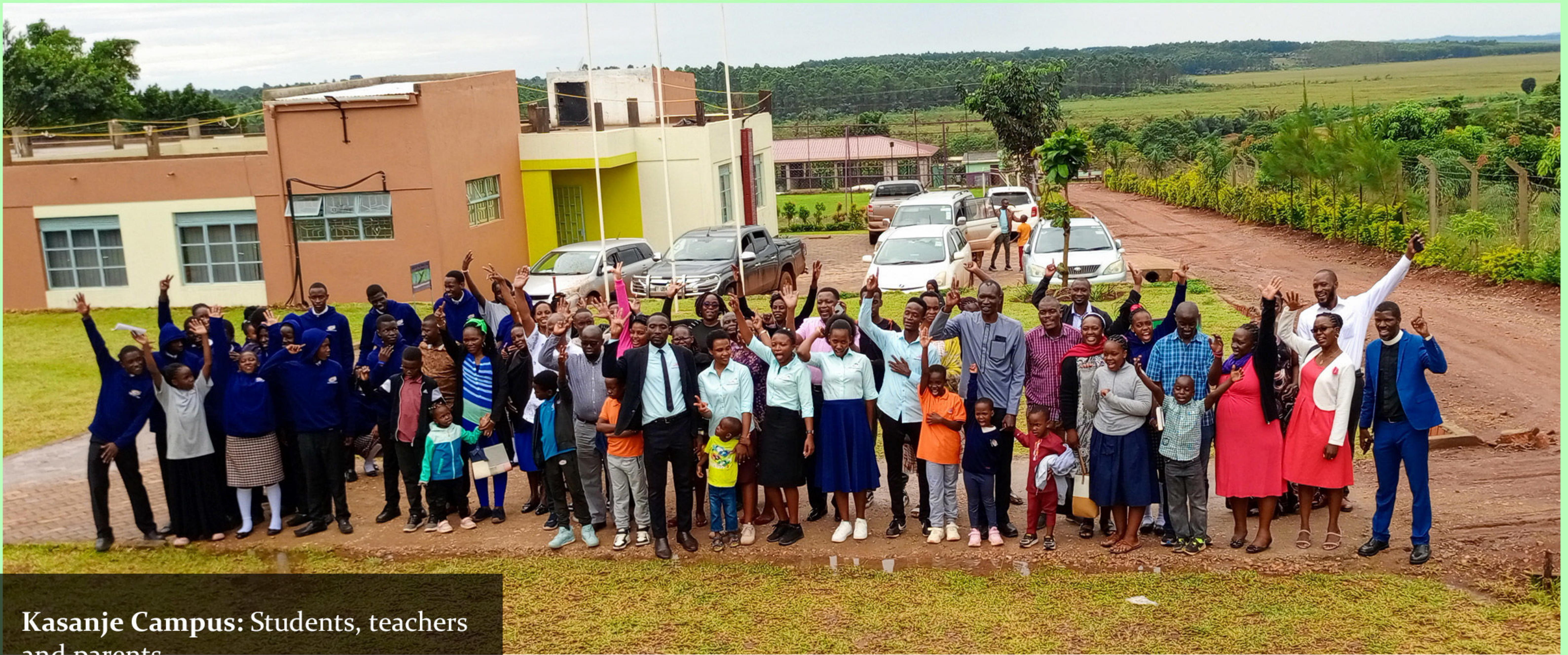
Kasanje Campus: Students, teachers and parents