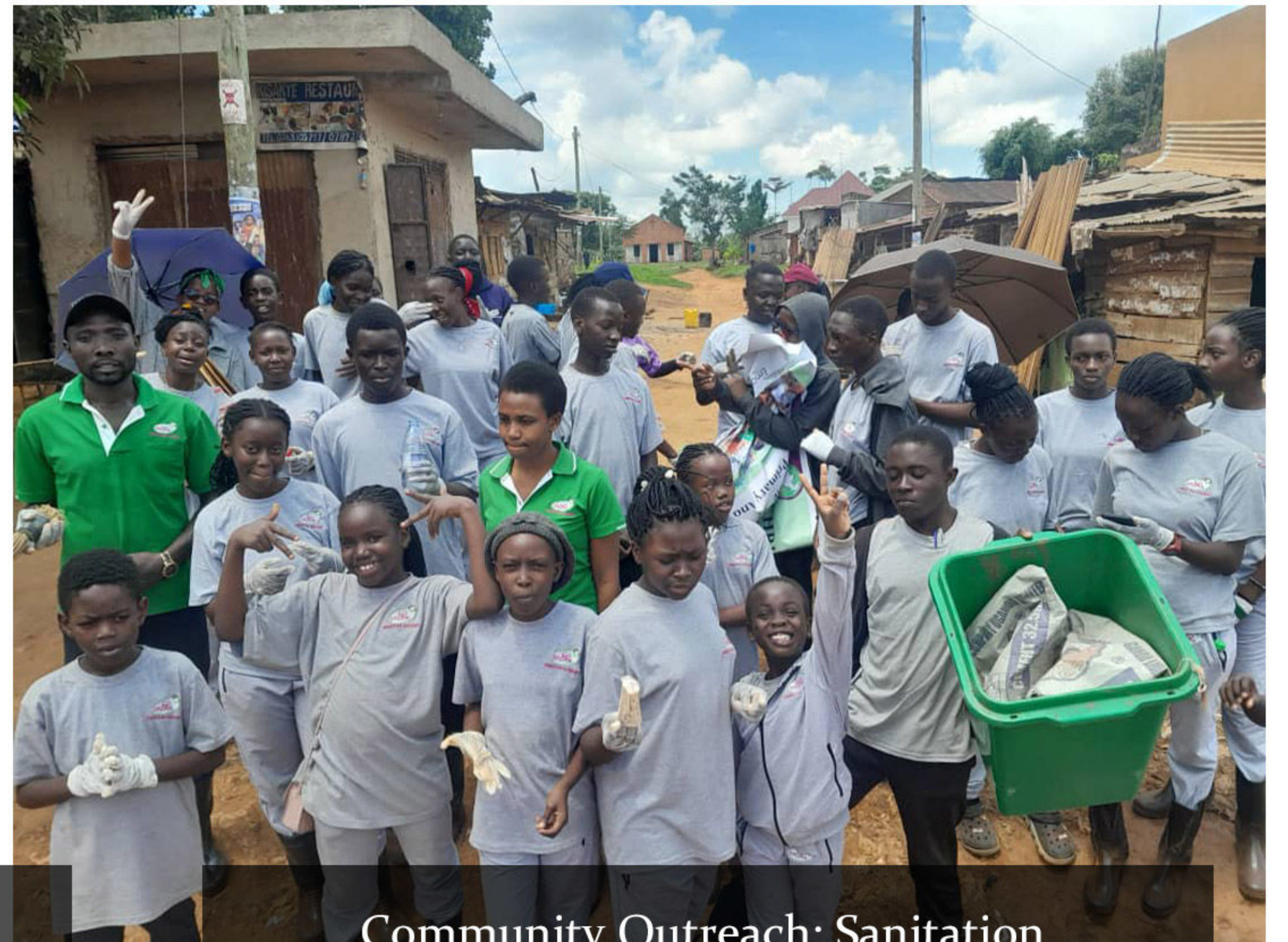
Community Outreach: Sanitation and Environment Cleaning