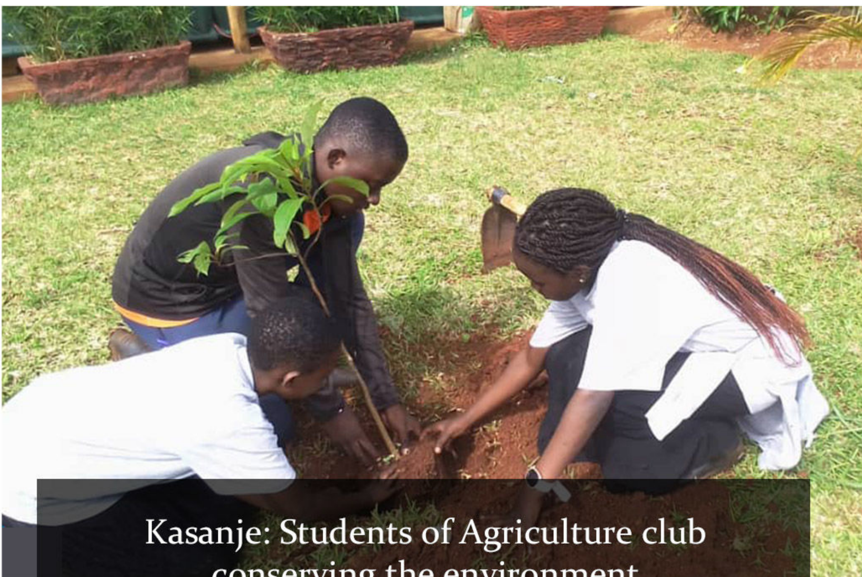
Kasanje: Students of Agriculture club conserving the environment