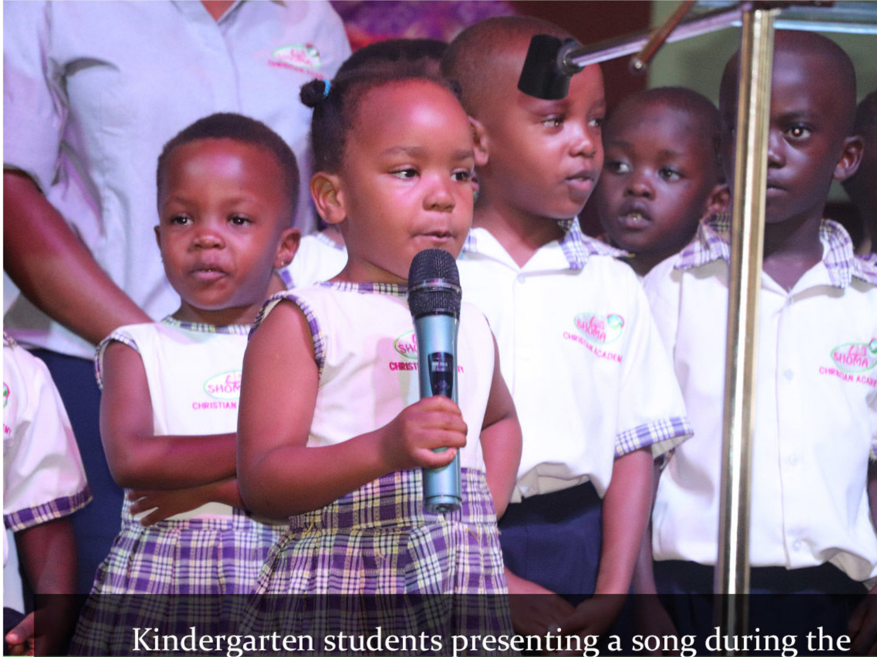
Kindergarten students presenting a song during the Thanksgiving Service at St. Kakumba Chapel