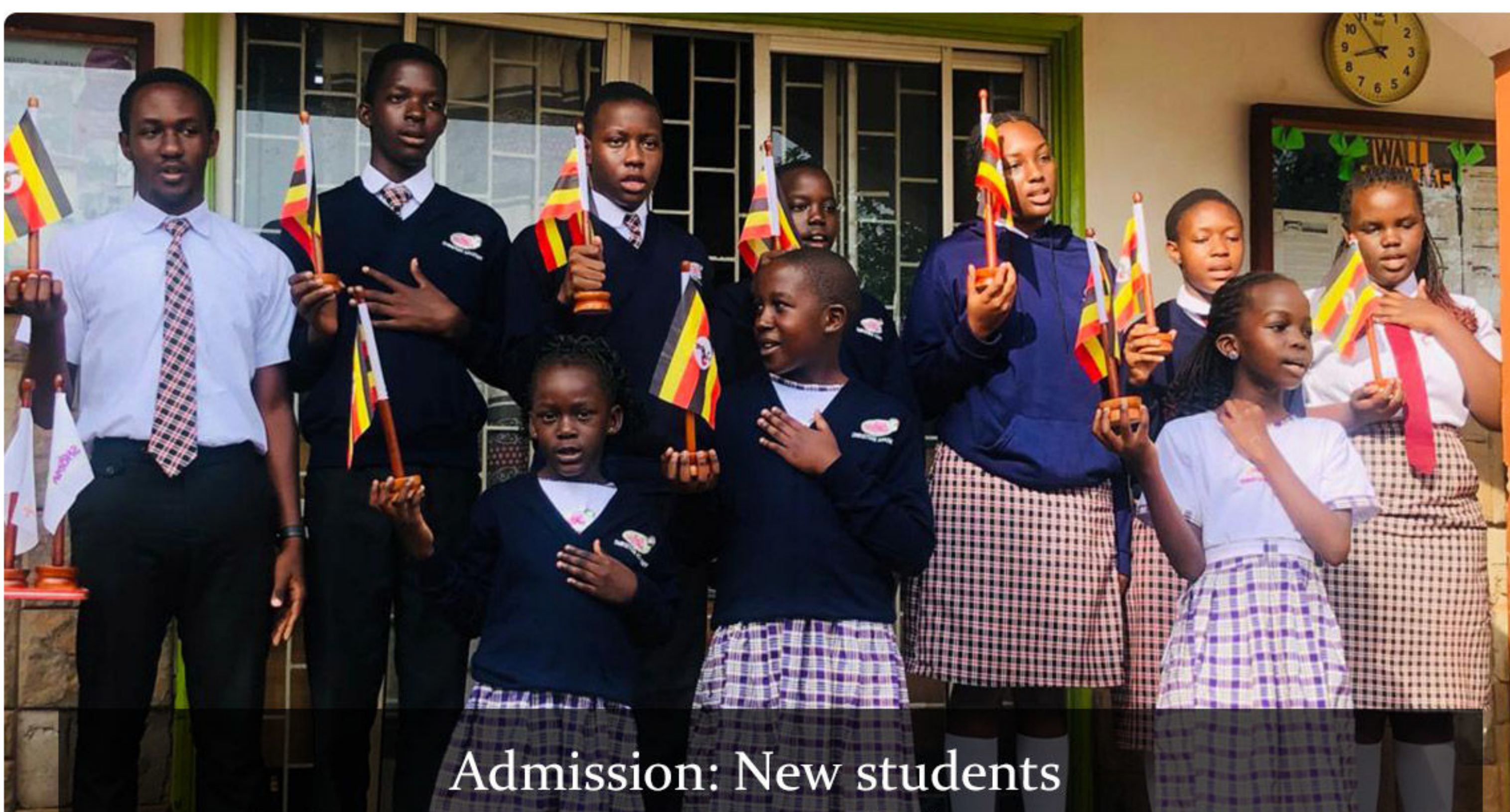
Admission: New students reciting their pledges